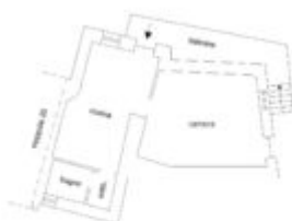
PIANO PRIMO 129,20 mt.