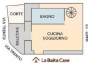
PIANTA PIANO TERRA H 2,35 m