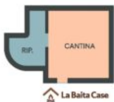
NTA PIANO PRIMO SOTTOSTRA H 2,25 m