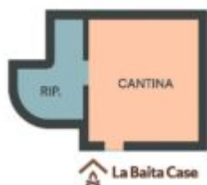
PIANTA PIANO PRIMO SOTTOSTRADA H 2,25 m