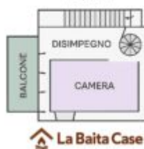
PIANTA PIANO PRIMO H 2,35 m