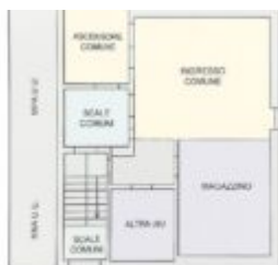
PIANO TERRA L = 81 m 2